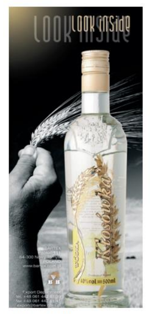
roll up 1x2 m