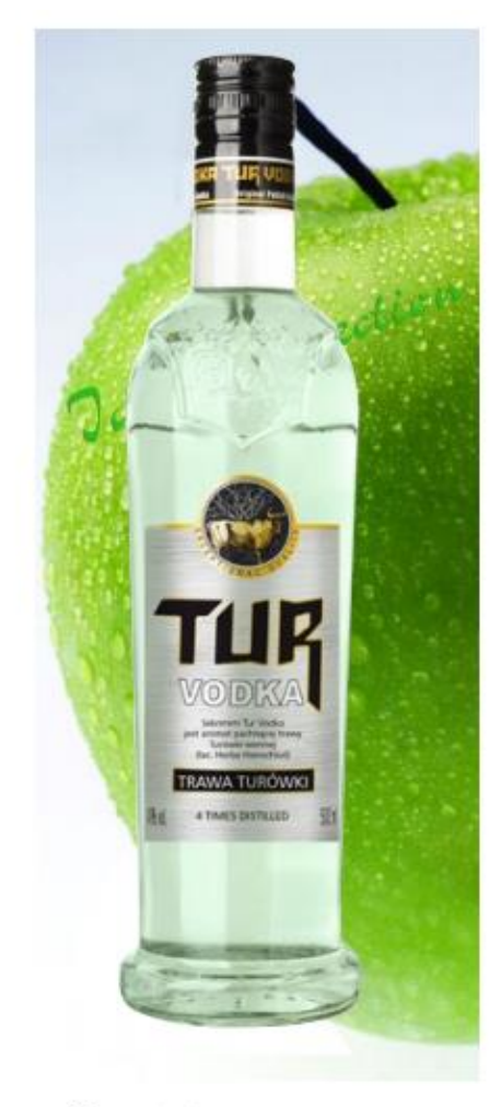
roll up 1x2 m