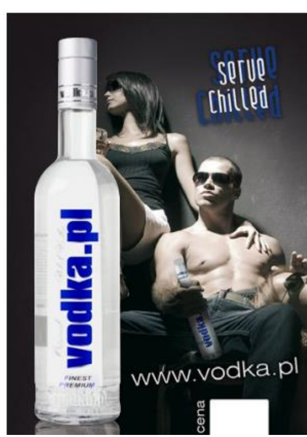
poster 70x100 cm